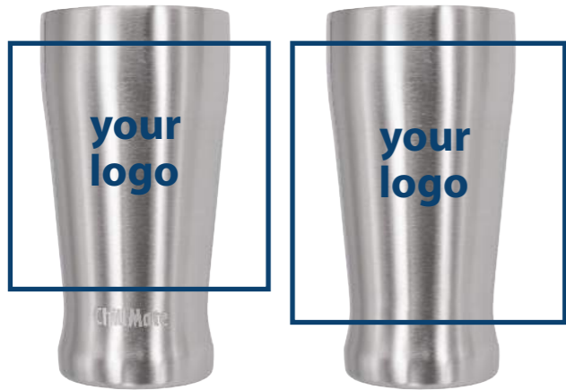
450 B cup