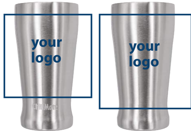
450 B cup